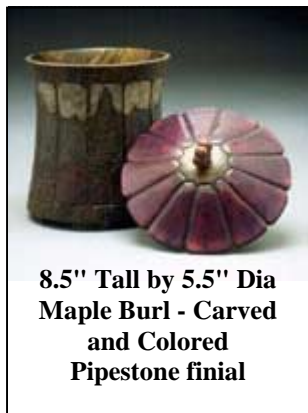
8.5" Tall by 5.5" Dia Maple Burl - Carved and Colored Pipestone finial

What makes this site unique is a feature called the CRITIQUE CENTRAL PROJECT . A number of images, along with a brief description, are provided of a piece of work created by one of the web site hosts. You, the website visitor, are asked to give your opinion /critique of the work. By clicking on a button titled Add Your Critique you are brought to a form that asks your skill level (from non-turner though advanced to collector) along with several questions on your feelings on the overall design of the piece, use of color, etc. On each question you can select: Neutral, Strongly Agree, Agree, Disagree, or Strongly Disagree. There is also a place for you to write your comments and suggestions. You can view the critiques of anyone who has responded along with a numerical summary (1= Strongly Disagree to 5 = Strongly Agree) to all of the questions. This provides a very good way to see how others view the piece of work and what they like and dislike about it.