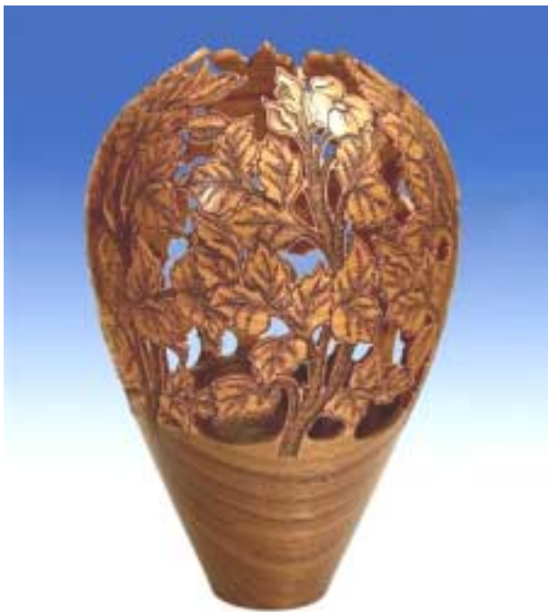
Cherry and Black Walnut finished with Min-wax Wipe On Poly – W 4” H 6” D 5 1/4” Entry #358 in the Decorated Vessel contest.