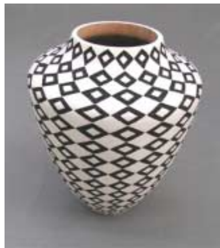
Maple and acrylic paints – W 9” H 12” D 9”. Entry #353 from Decorated Vessel contest

But there is loads more to see. There are over 560 articles that you can access, in eight different categories: Power Tools & Techniques, Hand Tools & Techniques, Turning Tools & Techniques, Jigs, Tips & Tricks, Furniture Making, Finishing, Shop Topics, and Reviews. Under Turning Tools & Techniques you can find articles on Waterlox on Turnings, Problem Solving with the Bowl Gouge, Shop Built Texturing/Spiraling Tool, Bowl Depth Gauge, and many more. In addition, all the articles from the now defunct Badger Pond website (many related to turning) can be found on the WoodCentral site.