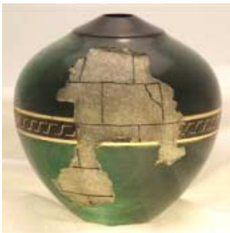
Box Elder, Gold Leaf, acrylic paint – W 6.5” H 7” D 6.5” Entry #350 from the Decorated Vessel contest

There is a contest section – sponsored by a different tool company, each month or so. The current contest is for Segmented Turnings and runs till November 15 th (see page 9 for more info about this contest and how to enter). Past contest have included: Turning “Decorated Vessels” and Turning “Two Board Feet”. Photos from the entries and brief explanations of the work for the current and previous contests can be accessed on the website. To view and be inspired by these entries alone is worth a visit to this website.