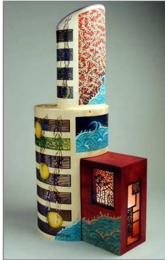
Above: Waiting for the Moon to Go Away Left: Detail from Diminishing Fifth (2008) Right: Midnight Sun (2007)