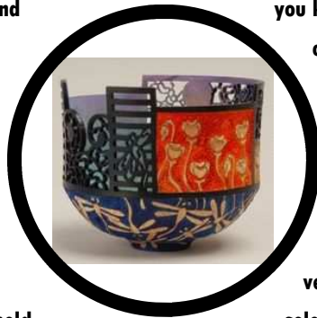
Above: H 2 O (2008) Right: Luminous Sky (2008) All images used by permission of the artist.

Perhaps you've seen images of Binh's renowned thin-walled vessels, intricately pierced and adorned with colorful motifs inspired from both nature and cultures of the Far East. Maybe you've even attended a symposium and have seen Binh demonstrate a little of his technique, viewed his work on display, or possibly even heard what he experienced through multiple attempts to escape Communist held Viet Nam after the U.S. pulled out in 1975 at